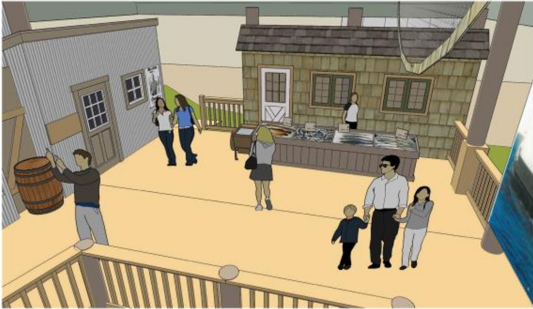
Bassett Museum Fisheries Exhibits RENDERINGS: Fisheries Outdoor Exhibits Render 15 good