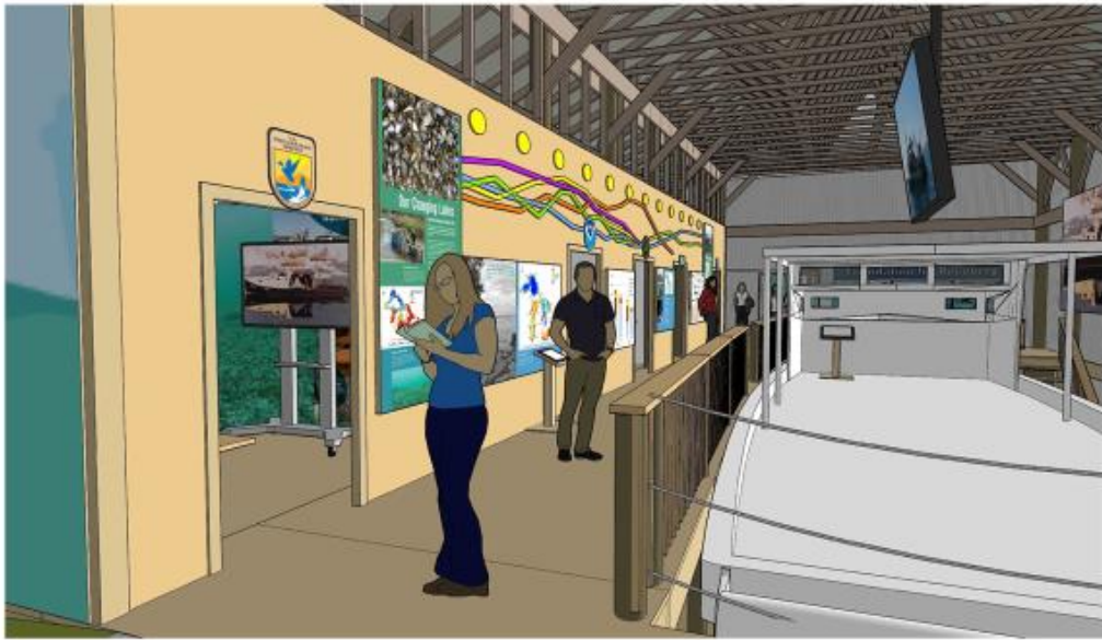
Bassett Museum Fisheries Exhibits RENDERINGS: Fisheries Outdoor Exhibits Render 22 good