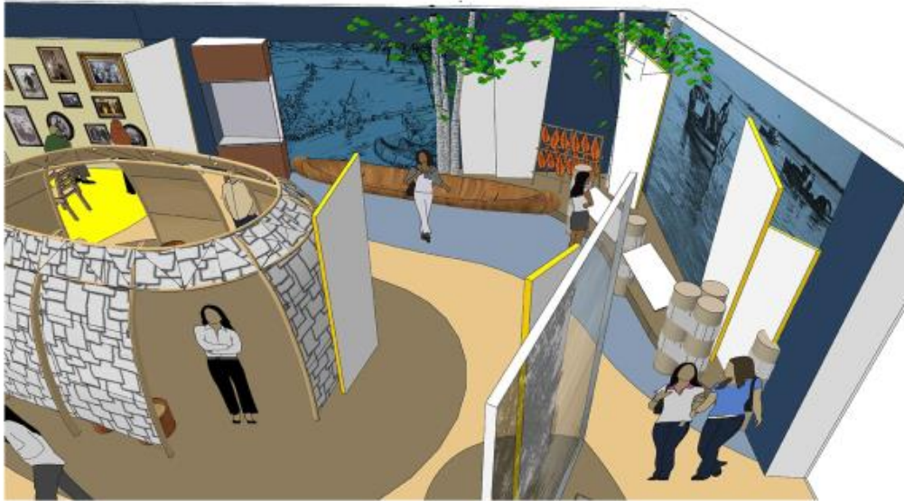
Besser Museum Fisheries Exhibits RENDERINGS: Native American Gallery Render 07 good