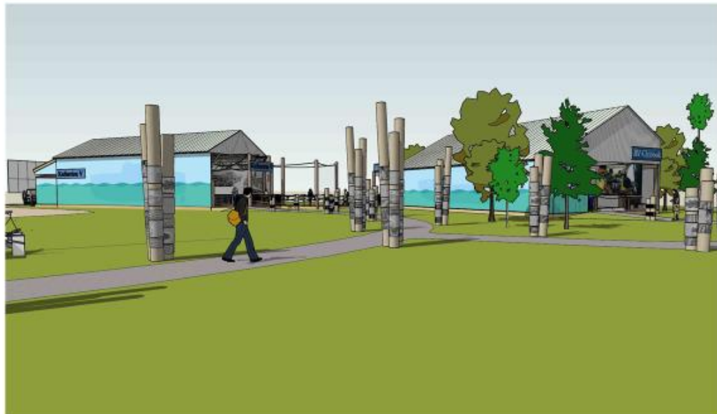
Besser Museum Fisheries Exhibits RENDERINGS: Fisheries Outdoor Exhibits Render 11 good