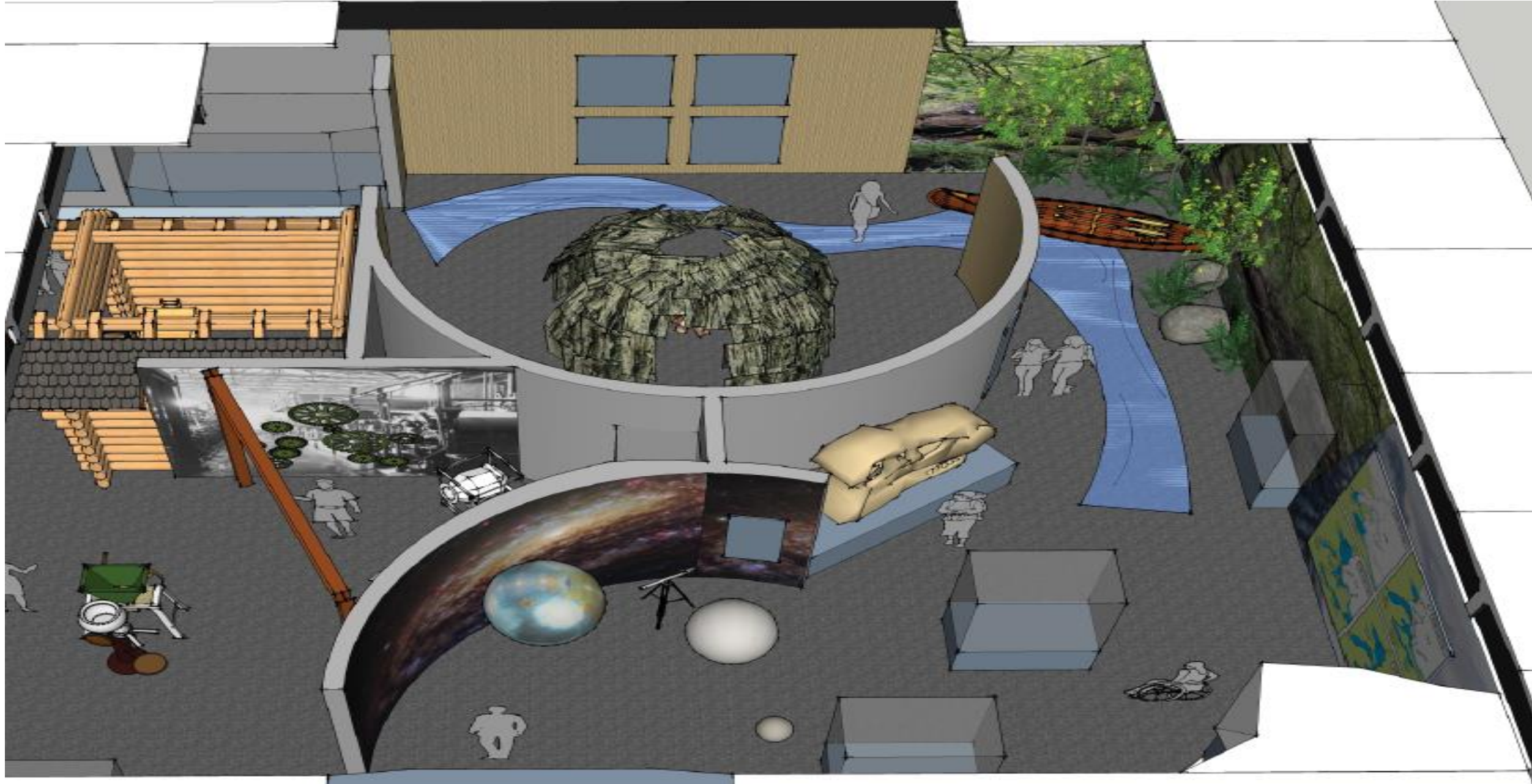
Schematic Design by Cornerstone Architects